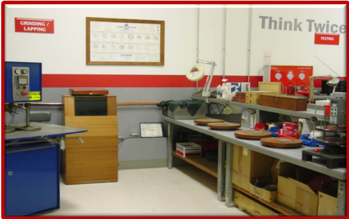
SEAL FACE LAPPING EQUIPMENT