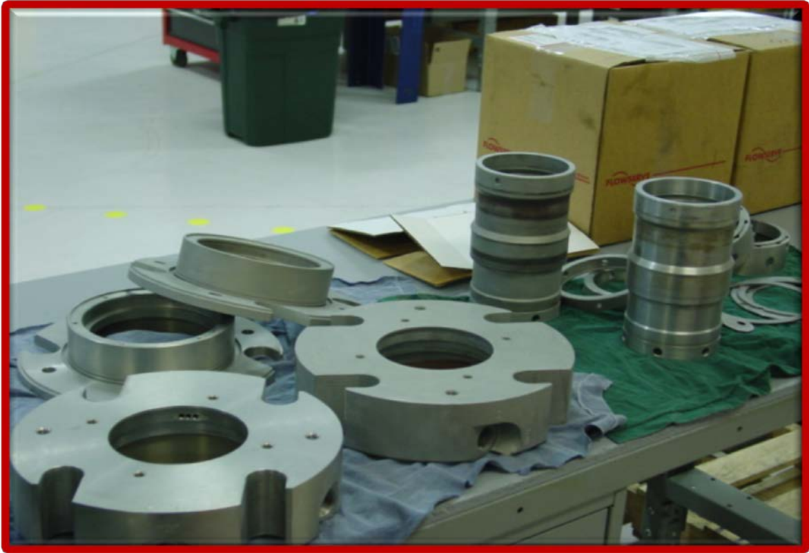
ROBUST ENGINEERED SEAL REPAIRS