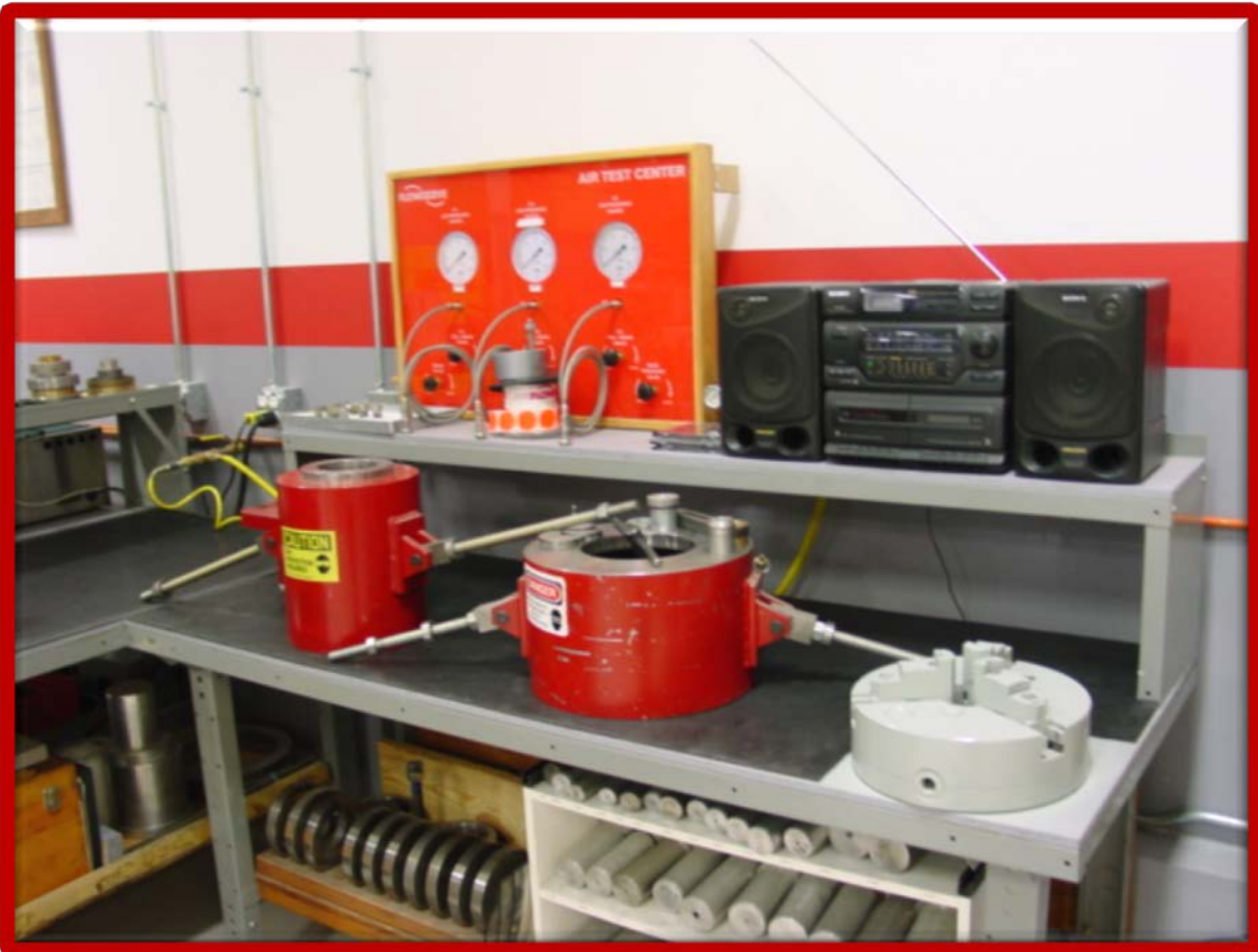
AIR TEST CERTIFICATION