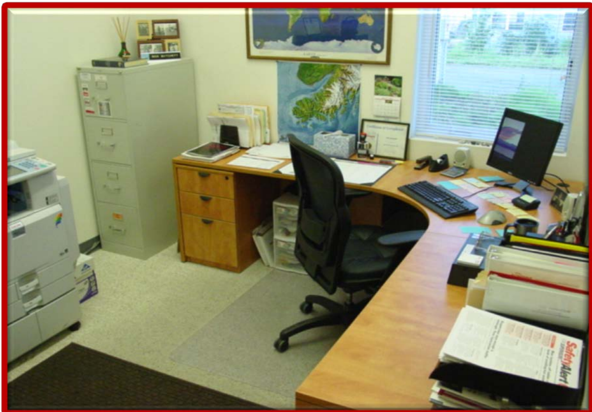
OFFICE / ADMINISTRATION