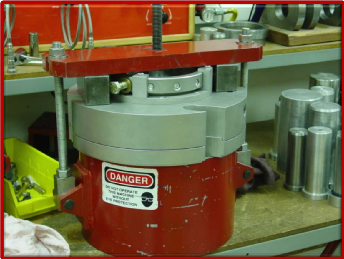
FINAL AIR TEST