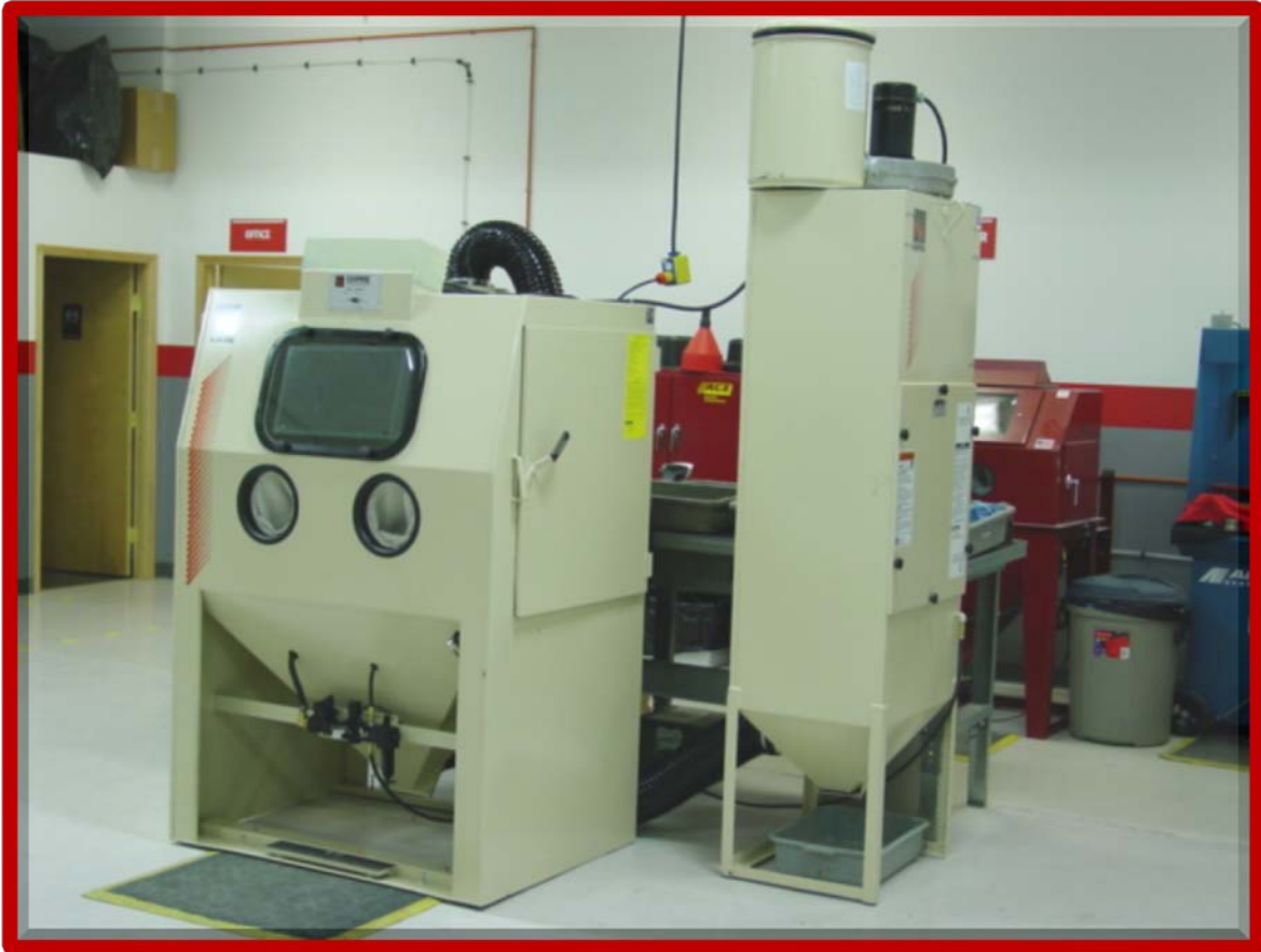
GLASS BEAD SYSTEM