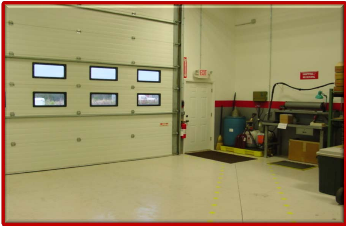
LARGE OPERATIONAL SHIPPING / RECEIVING